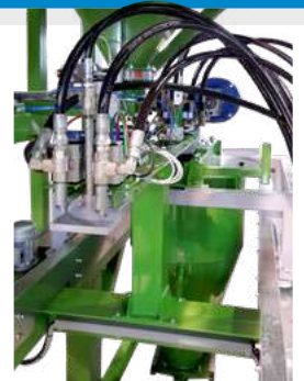
GRANULE'S IMPREGNATION WITH RESIN